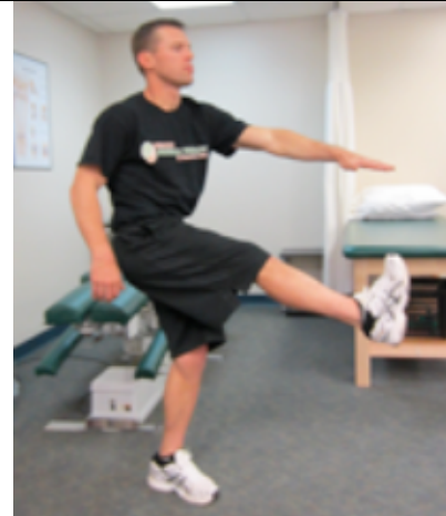
Straight Leg Raise, Hamstring Stretch

(Extend arms, rotate 10x each side, hold each for one deep breath)