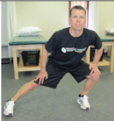
Lateral Lunge, Side to Side

(Pull ankle to butt & raise up on opposite toe, 10x each leg)