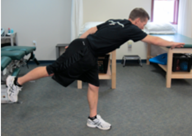
Straight Leg, Dead Lift

(Stand on one leg, bend over keeping knee & back straight then reach with opposite arm. 10x each side)